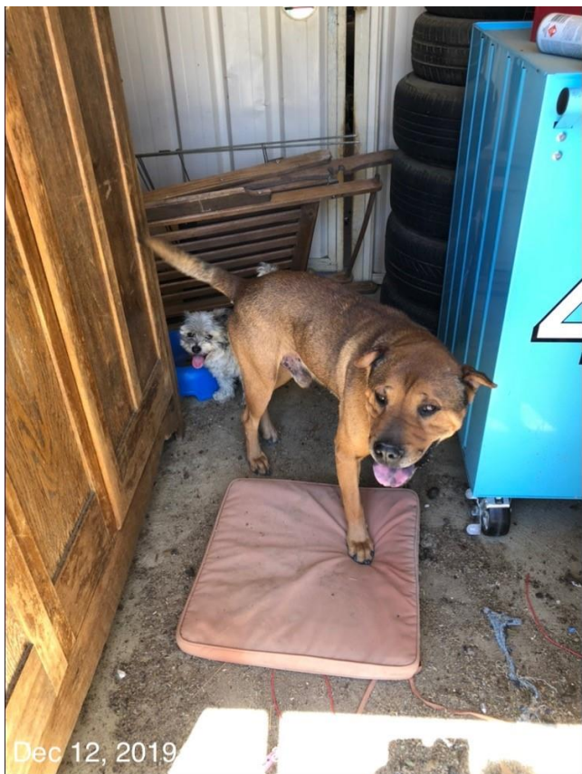
Under cover area