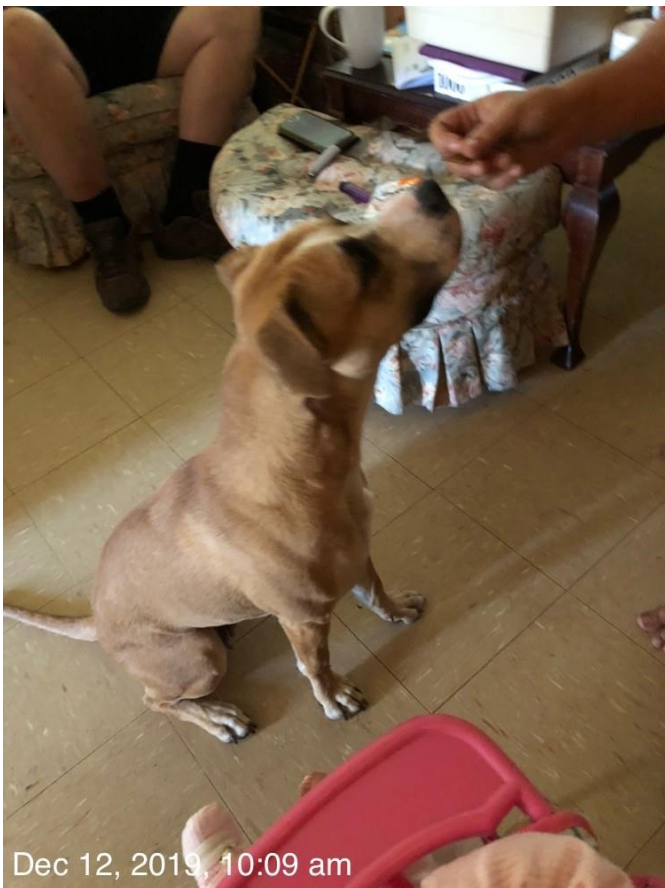
3 rd Dog Nia