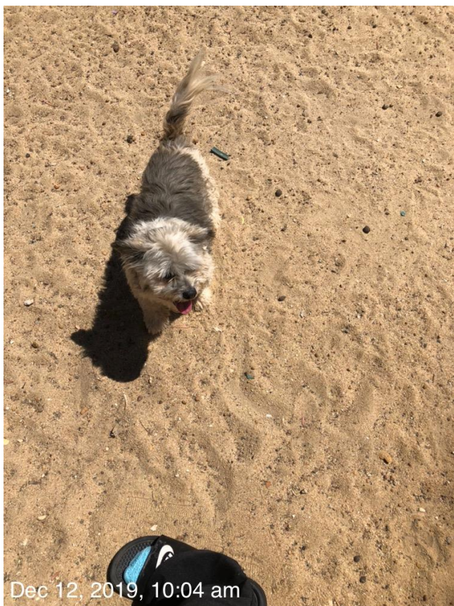
17 year old - Sasha