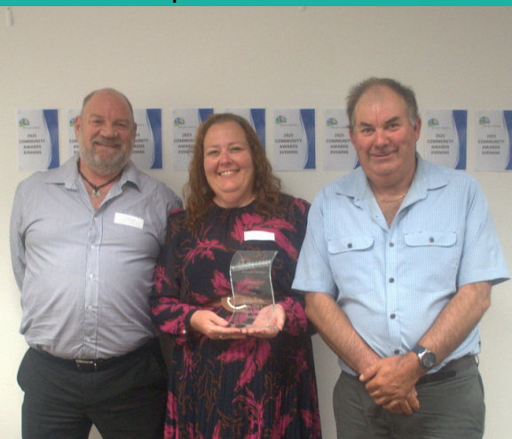
Tidy Towns Association