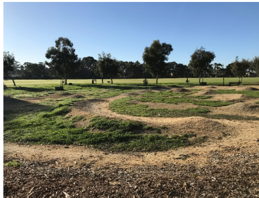
City of Vincent's Pop-Up Pump-Track

In follow-up to the expressions of interest raised in particular by youth within the community, Shire staff investigated a variety of different styles of Pump-Track, as to gain an understanding from other Local Government's experience in what types of Pump-Track have been well-received by the community. Noteworthy in the investigation was the City of Vincent's "Pop-Up Play" Pump-Track, whereby the City utilised a length of undeveloped bushland into a bike track created from small scale works using natural materials.