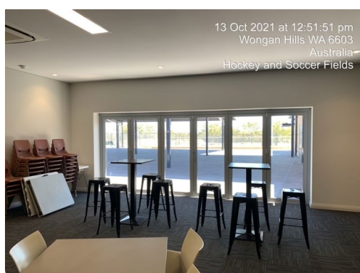
Current bi-fold doors on entry to outdoor area

The applicant has stated that structurally there is no significant changes except for the need to recess the floor track into the floor to remove any tripping hazard.