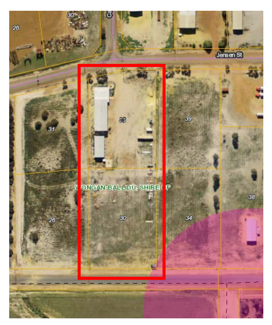
Bushfire Prone Area Map Date 11/11/2020