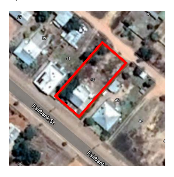
Google Maps 22/10/2020

The applicant is seeking Council's approval to terminate the lease between them and the Shire of Wongan-Ballidu. A lease between the applicant and the Shire of Wongan-Ballidu commenced on 1 January 2013 and is due to expire on 31 December 2034.