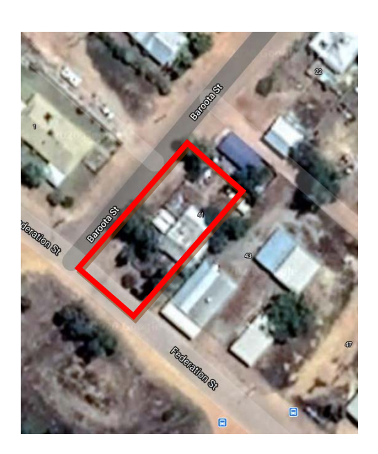
Google Maps 22/10/2020

Lot 1 Federation Street, Ballidu comprises a total area of approximately 0.1011 hectares. The property has an existing single dwelling and 6 metres x 12 metres steel Colourbond shed.