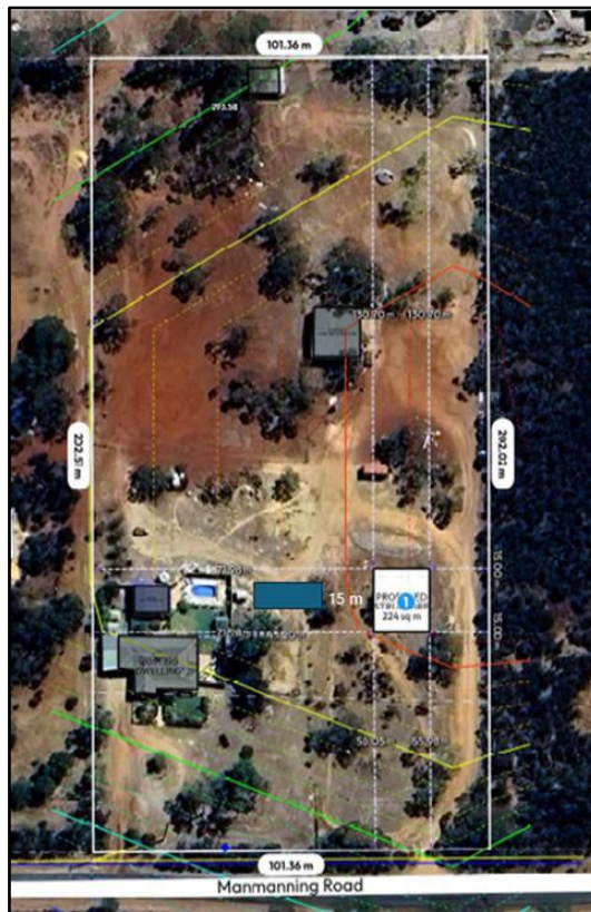
Plan provided by Castlerock Developments Pty Ltd with additions by Owner NB: The outbuilding is denoted by the white square labelled 1 above.