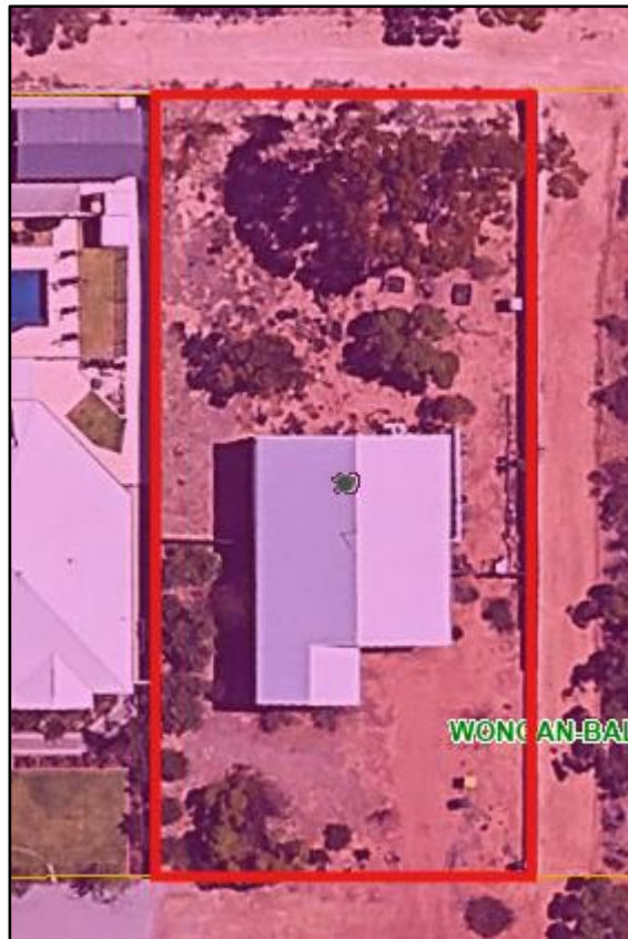
Bushfire Prone Map 10 April 2026

The proposed building is located within a designated bushfire prone area. Due to the shed being not habitable and will be positioned more than 6 metres from the existing residence, a BAL assessment is not required as outlined in State Planning Policy 3.7 Bushfire.