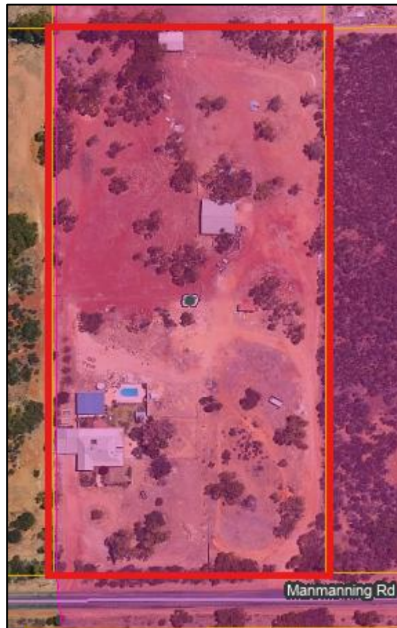
Bushfire Prone Map 10 April 2026

The proposed building is located within a designated bushfire prone area. Due to the shed being not habitable and will be positioned more than 6 metres from the existing residence, a BAL assessment is not required as outlined in State Planning Policy 3.7 Bushfire.