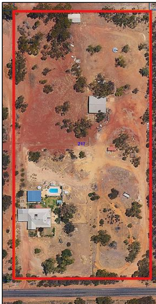
Synergy Maps 10 April 2026

The applicant is seeking Council's development approval for the construction and use of a new outbuilding for personal vehicles and oversized recreational equipment measuring 9m x 16m and a 5m x 16m lean to, with a 3.5m wall height and an overall height of 4.293m ridge.